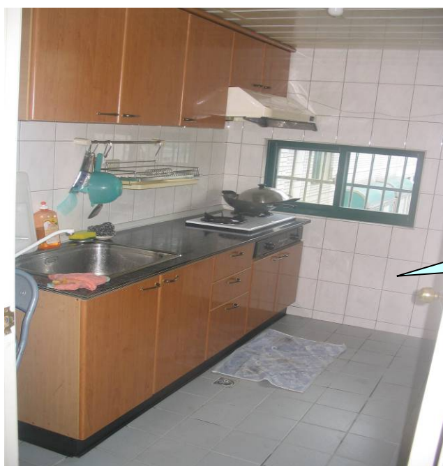
Full kitchen facilities look like this